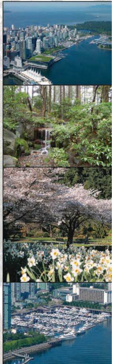
Photo Credits: Tourism Vancouver Capilano Suspension Bridge Tourism Vancouver / Tom Ryan Vancouver